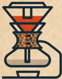
Syphone ₹ 370