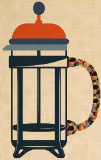
French Press ₹ 370