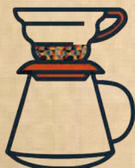
Kalita Wave ₹ 370