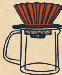
Origami ₹ 370