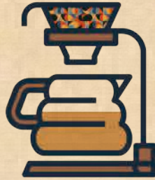
V60(Pour Over) ₹ 370