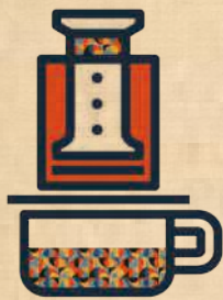
Aeropress ₹ 370