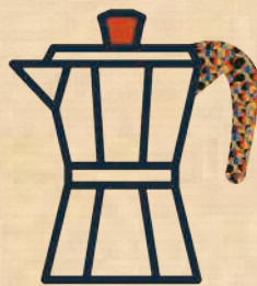
Moka Pot ₹ 370